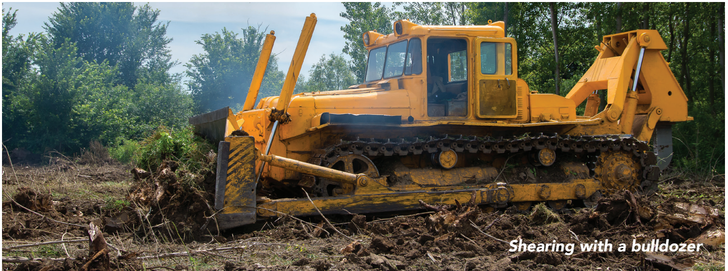
Shearing with a bulldozer